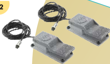
FOOT SWITCH 02