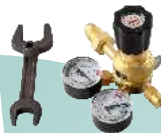
OXYGEN REGULATOR 01